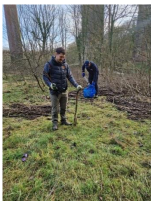
Tree planting and litter picking with Northumbrian Water