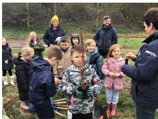
Planting with school children from Peterlee