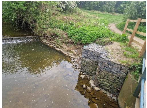
New seating provided / restoration of existing seating areas / revetment work for bridge