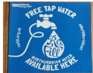
Photo of the dene / Beach clean and refill stations now provided in the café