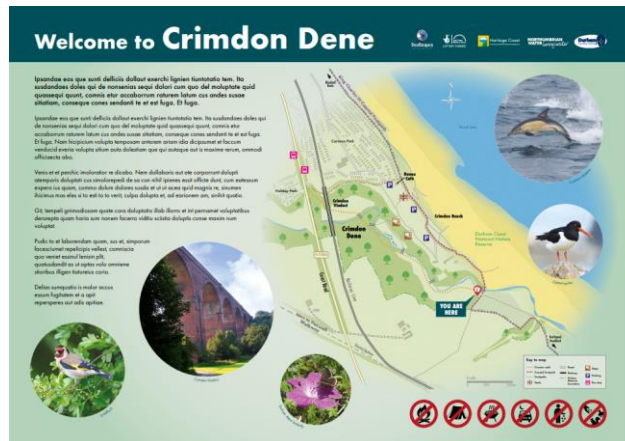
New interpretation panel design