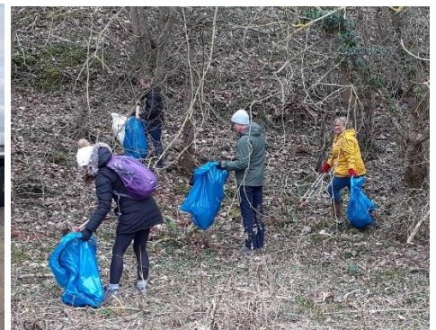
Some of the beach clean groups at work on the coast an in the dene