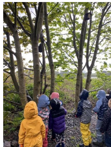
Schools pond dipping and bat/ bird box surveying