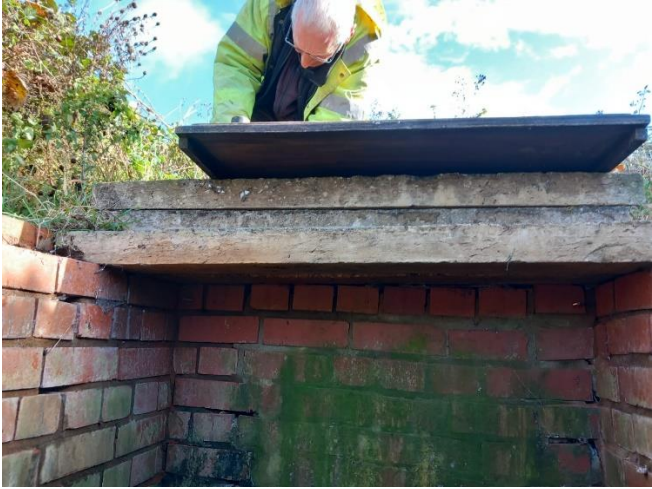
Preparing installation of bat roost