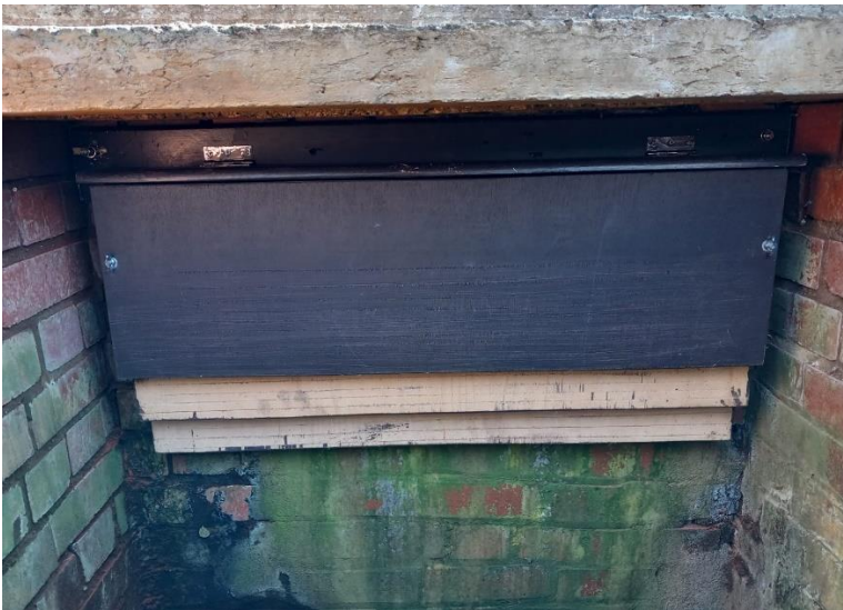
3 tier cavity bat roost for Daubenton's bat in sluice