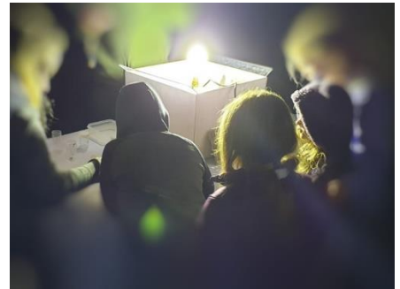
New interpretation panel on the jetty Community events: Bat & Moths night / Wildlife walk