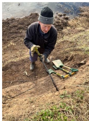
Holes being created in the bank for potential nest sites