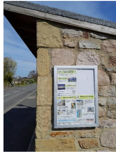
Stroller and wheelchair users on improved paths New noticeboard at local bus stop promoting the site and events