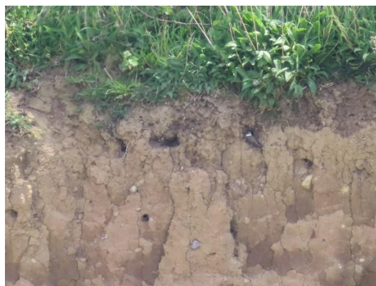
Volunteers clearing the new sand martin bank Sand martins investigating the new nest site – early May 2024