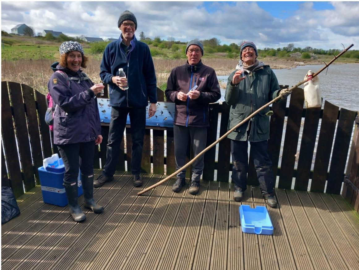
Water quality testing in April 2024