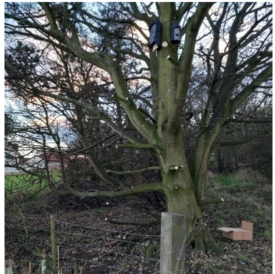
Newly installed bat boxes on site