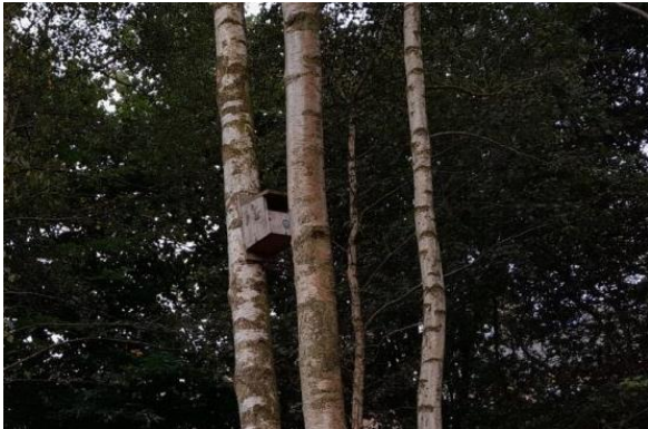
New bat and bird boxes installed at the site