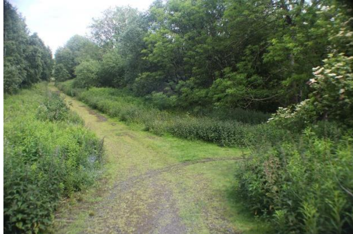
New entrance at West End by volunteers, clear paths have been created through scrub and woodland areas