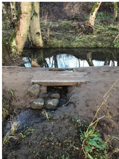
Pond and leaky dam outlet