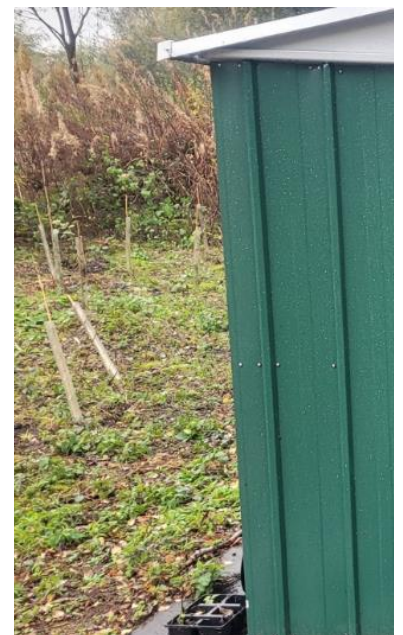
Trees planted near to shed