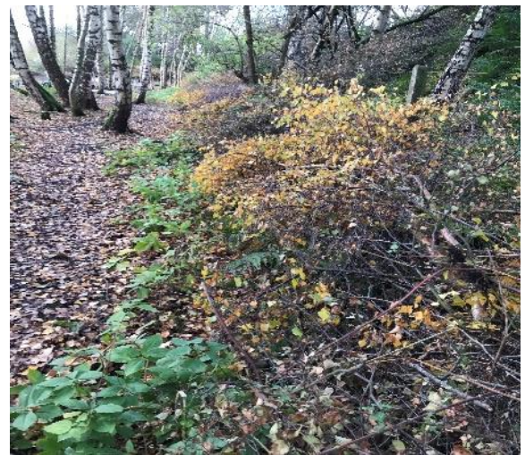
Habitat Pile created from cleared wood