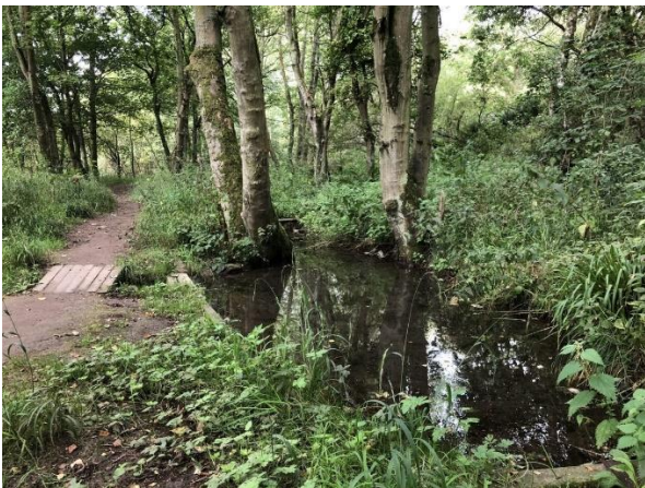
New pond with a leaky dam outlet