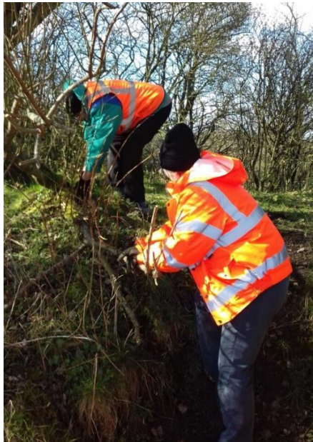
Volunteers removing diseased ash trees