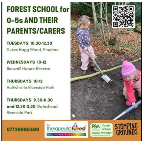
Education/Forest School Area and Stomping Grounds Advert