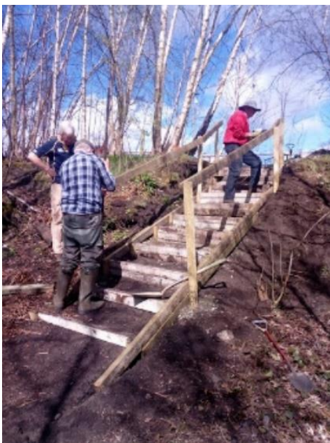
New steps being installed by volunteers